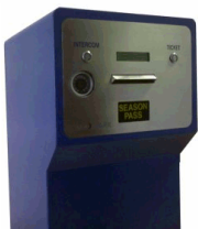
Optional- build-in CCD Camera